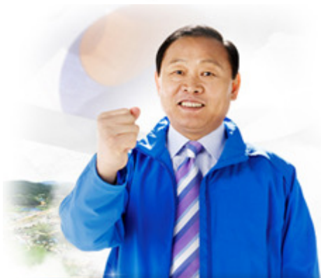
Chairman of 2012 Pocheon World University Taekwondo Championship organizing committee