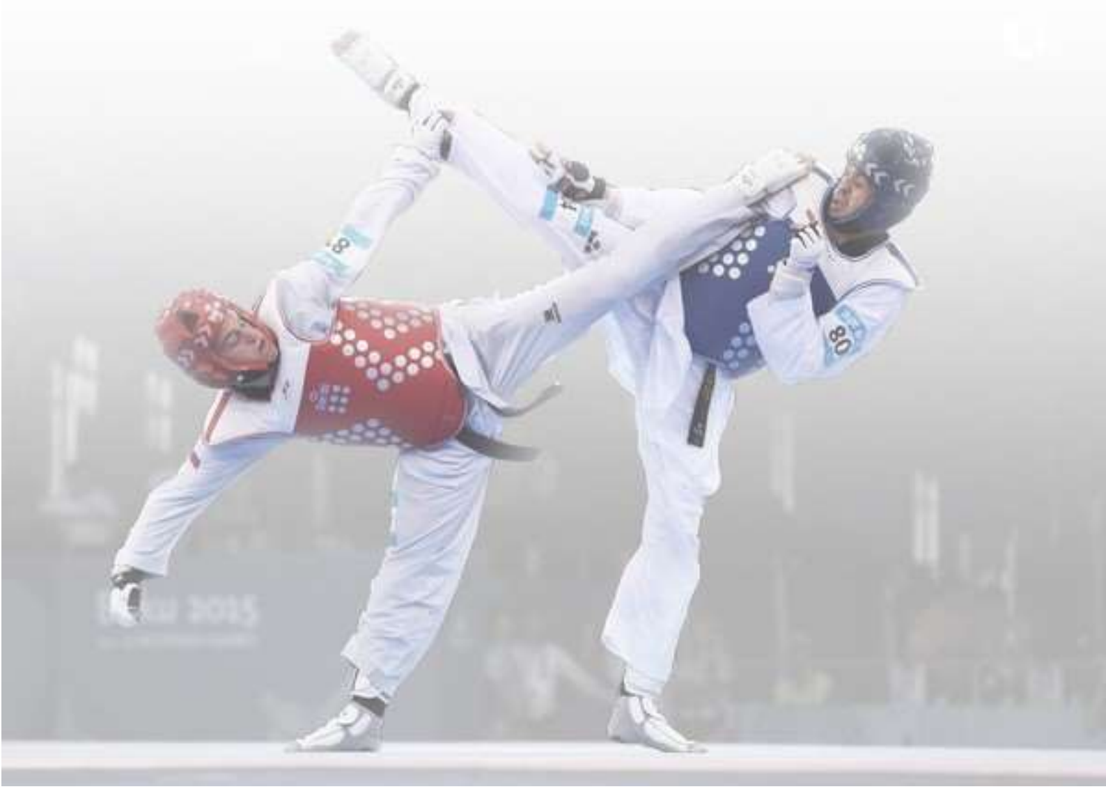
25<sup>th</sup> – 26<sup>th</sup> February 2023 Ljubljana, Slovenia