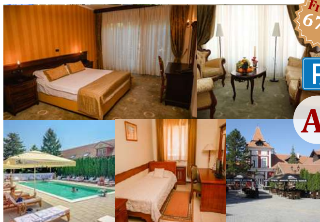
Located 6 km from the competition venue, surrounded by nature with a peaceful atmosphere.