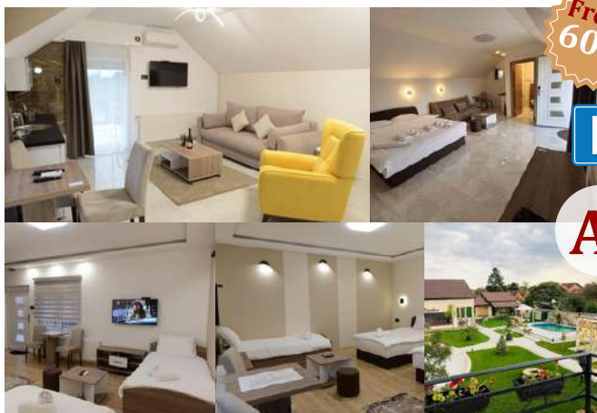
Located 3 km from the sports hall, in a quiet part of the city, 7 minutes by car.