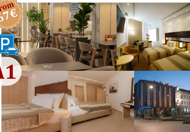
City center, 10 minutes walking distance from the competition hall, 3 minutes by car.